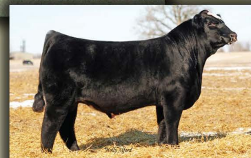
FBF1/SF Ignition A811, Full Sib