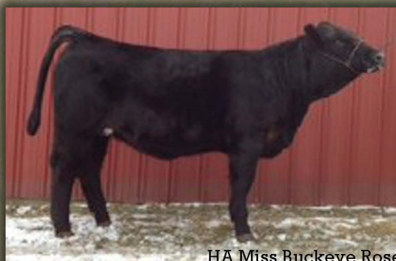
HA Miss Buckeye Rose