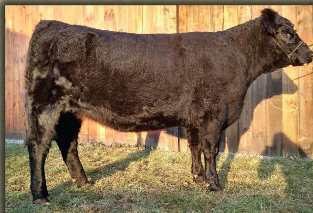
Hillcrest Miss Angel