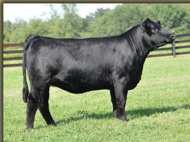
Lazy H Burnin Magic