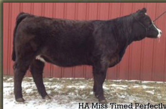
HA Miss Timed Perfectly