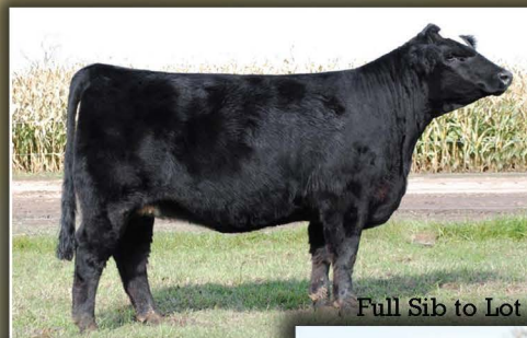
Full Sib to Lot 1