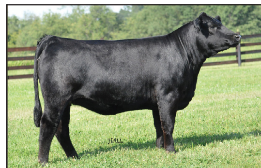
Above: High selling lot Lazy H Burning Magic.