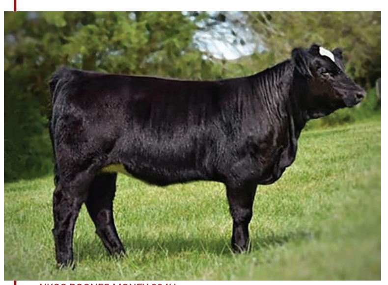
NKCC BOONES MONEY 004H

This is an outstanding 1/2 Simmi March baby out of Bandwagon with plenty of eye apparel. It will be hard to miss this heifer with chrome on her legs and the brockel Face. The mother of this calf is one of my foundation cows' in my herd.