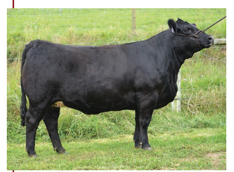
BV LURIE F30

Due 1/2/2021 to IR Imperial D958 (#3310738). This stout Rimrock heifer is the first female we have out of our red cow from Missing Rail Simmentals. Plenty of power here with great maternal traits. Look us up when the Imperial calf hits the ground as we are always looking for nice red ones to show.