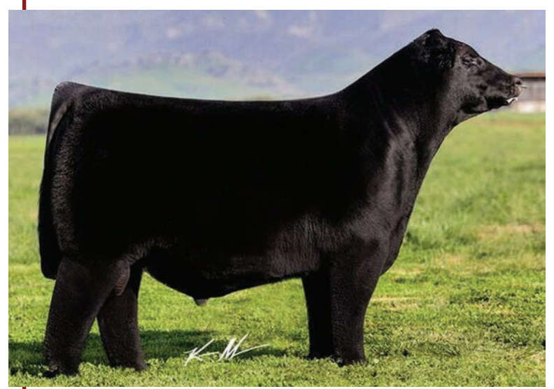
COLBURN PRIMO 5153