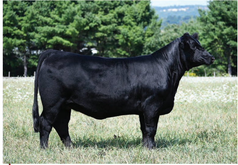
HFSC DRANGONFLY HG27

Due 3/30/2021 to THSF LOVER BOY B 33 (#2983443). This half blood bred heifer puts the pieces together in a complete package, backed by proven and prominent genetics. Out of one of our top Donors, "Heges Zahra" and sired by "Silverias Style", she puts body mass, sound footed, and muscle shape and dimension together to make a complete female. Due to calf early April to the full brother of the deceased Quantum Leap, THSF LOVER BOY B33, the 2106 Denver Champion. This calf will sure be something to look forward to. Hillcrest Farm is BQA certified. BVD tested negative.