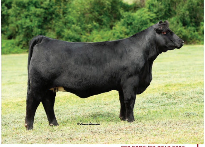
FFS FOREVER STAR F007