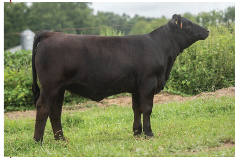
CHARMONT SWEET PEA AG4J

This black heifer is long bodied with a nice wide top and lots of hind quarter to her. She has sound feet and leg structure that goes along with her smooth movement. She has a quiet disposition and we think this heifer will go on to make a powerful cow.