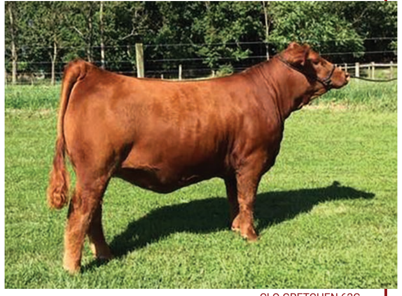
CLO GRETCHEN 62G

Moderation, soundness, big-footed, and cow-power best describe 62G. She is backed by many of the most prominent and widely used sires within the breed. Then look at the maternal side of her pedigree and you will see the same level of excellence. Gretchen's dam is one of the rare, highly sought after duaghters of Two Step, an outstanding blaze faced female in her own right. You can depend on her dam to produce a 'keeper' year after year. To complete this fall red powerhouse, look at her genetic profile...balance with superiority. Well above the breed average in a majority of the traits measured. Any serious breeder would be well served to add this feminine standout to their breeding program. Sells open. OCV, BVD-PI3 negative. Herd is certified and accredited. BQA certified. Buy with confidence.