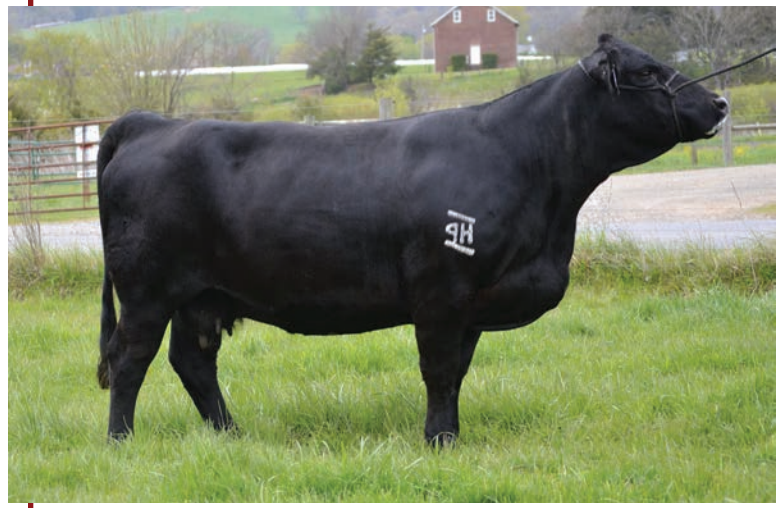
HPF MISS PEP X209