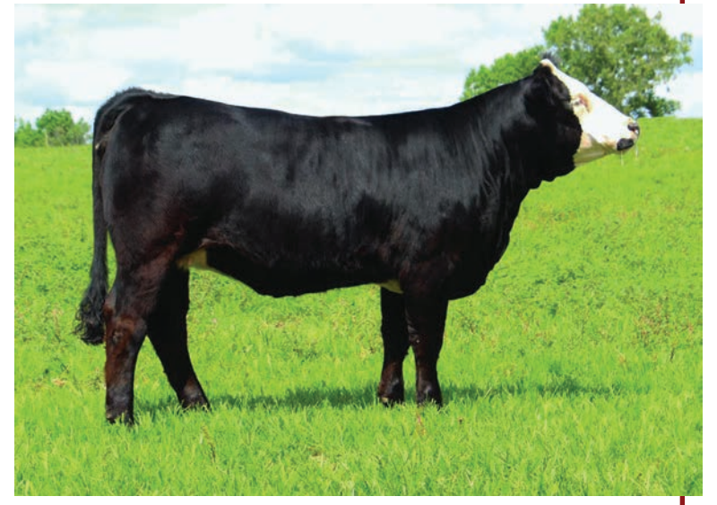
E&D AUBREY G20

This Bullseve daughter is one we should be keeping! Aubrev is a powerful. bold ribbed, heifer that still is nice and fluid in her movement. Her dam is a maternal sister to the great TNGL A Gemstone cow that has had many high sellers and winners for Ferguson Show Cattle and Windy Ridge Simmentals. Strong genetics here.