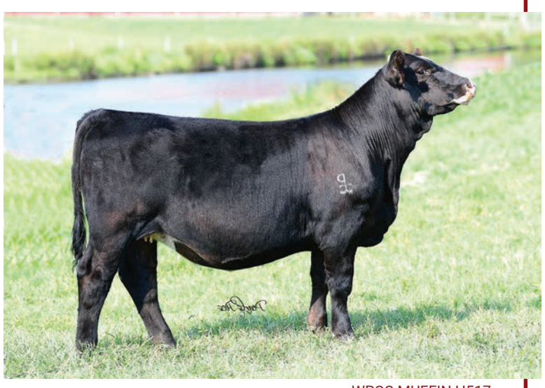
WPCC MUFFIN H517

Here is a female you can do about anything with. Anything I've have that goes back to the Khloe cow has always shown well but they all preform like no other when put into production. This one is so big bodied and legged it'd be hard to not like her. Take my advice on ol muffin and bid with confidence these cattle flat work.