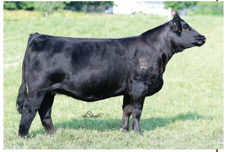
L/P QUEEN OF DENIAL G109

Due 2/5/2021 to TJSC Hammertime 35D (#3185062). This purebred is one that is hard to part with, but I've wanted to offer my best. G109 is sired by the popular Executive Order, and her dam is a fill sib to the champion purebred female i showed at the 2018 Eastern Regionals. Sleek fronted, soft bodied, and an easy keeping female with a awesome pedigree.