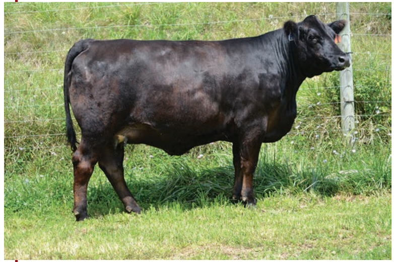
BV LOCKET F20