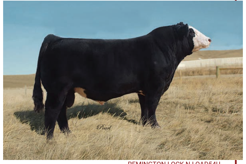
REMINGTON LOCK N LOAD54U

Due 11/8/2020 to HPF Tradecraft D010 (#3124189). Personality is a cow that checks all the boxes - Power, Pedigree Performance and Phenotype. She is a big stout hipped, soggy made black baldy cow right in the prime of her life. She is a product of the great Lazy H Farm as she was bought as a pregnancy at their dispersal. She has consistently produced offspring that are stout and powerful and right for the times. She is due to calve shortly after the sale to HPF Tradecraft D010 for another impressive calf. Take Personality home and watch your neighbors drool when they see her in your pasture.