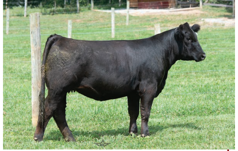
SS-F MORENA 1911

Due 3/6/21 to CSCX BANDWAGON 513A. Vet confirmed safe in calf. Excited for this breeding, we have a Bandwagon Heifer from her dam in the show pen from this years calf crop.