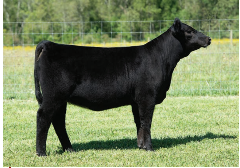
WINSLOW'S MAS DREAMS

This heifer comes out of one of my favorite Dream On cows who consistently produces structurally correct females that turn into great mothers. I have sold numerous females from her dam to juniors wanting to start purebred herds. Don't let the late maturity pattern fool you, females in this cow family are always a standout in the pasture.