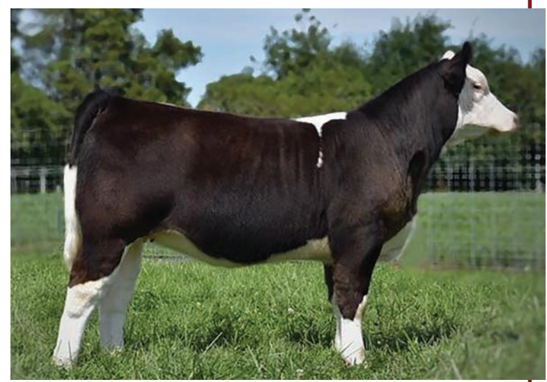
NKCC KONA 003H

This chromed up heifer is moderate in her build, expansive in her rib, and clean fronted. She is kid friendly and her mother was successfully campaigned by a junior in 2018. She comes from the Khloe cow family that has been a staple for Palmer Cattle Co. in recent years.