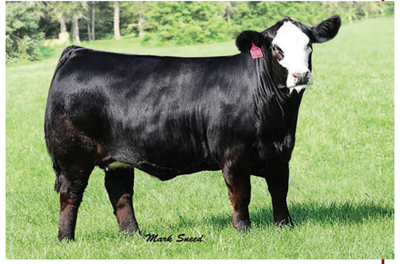
SVJ DSC SHEZA DANDY W71

See more photos, videos, and sale updates online at facebook.com/classicfarms