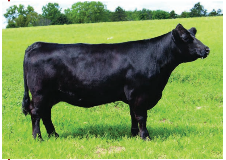
FSCI NEONS REGARD C503

Offering 3 embroys out of our Donor "Splish" and the super populaur S.A.M. Bull who was the talk of Denver and His Sire W/C Relentless needs no intro nor does his immortal Dam ands Grand Dam. If you like cattle that can be decibed in one word, massive, then Splish is your kind. Constructed right all the way through she is huge at the ground, has awesome foot and bone structure, is smooth jointed, and she moves out flawlessly. Huge in her midsection, big hipped, table topped back, and just a monster at all angles and stays super attractive up front. Splish milks like a Simmie should and raises a heavy weaning barn burner everytime! We had to start flushing this beast! Check out her Natural County O calf as lot 26. Offering 3 Conventional Embryos Guaranteeing 1 pregnancy if work is done my certified embryologist.