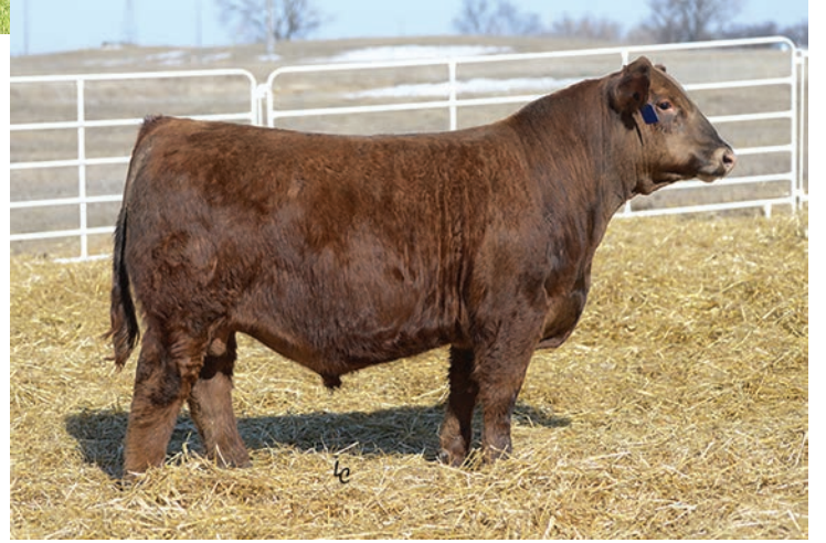
TOP: SNRS MS ANABELLE RAE 05A LEFT: BULL CALF OUT OF LOT 1 • RIGHT: SERVICE SIRE OF LOT 1

Anabelle Rae has been a productive Milestone daughter out of HPF Miss D Rae Y042, who was the focus of building our small, but quality herd of Simmental cattle. The influence of D Rae on our herd continues to remind us why we choose her a decade ago when we bought our first Simmental cow. She was a solid red purebred that combined the Desa Rae and Perfection cow families into a powerfully built and feminine package with the structural soundness that we all want in our females.