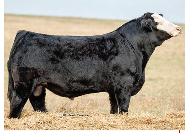
SSC SHELL SHOCKED 44B

Due 11/15/2020 to SSC Shell Shocked 44B (#2880060). Forever Star is a favorite around the farm in many ways. She is real easy going and easy to find when you go out to the pasture. Sometimes she'll find you if you don't find her to get some attention. Another reason she's is a favorite is because she is so easy on the eyes, being deep bodied, stout hipped and clean fronted. To add to her value even more add in her strong cow families with both the $50,000 Sheza Star and the multi-million dollar producing Miss Werning 8543U. Forever Star also comes with a track record in the show ring. She was shown by my son at the 2020 PA State Farm show where she was in the purple and was crowned Senior Calf Champion. Forever Star is a young female with a ton of future and I'm confident she will kick it into the next gear(Production) shortly after the sale when she will lay down and calve to the popular calving ease bull, SSC Shell Shocked 44B. So when the gavel falls on sale day make sure you have the winning bid because you are going to want her making money for you for a long time into the future!!