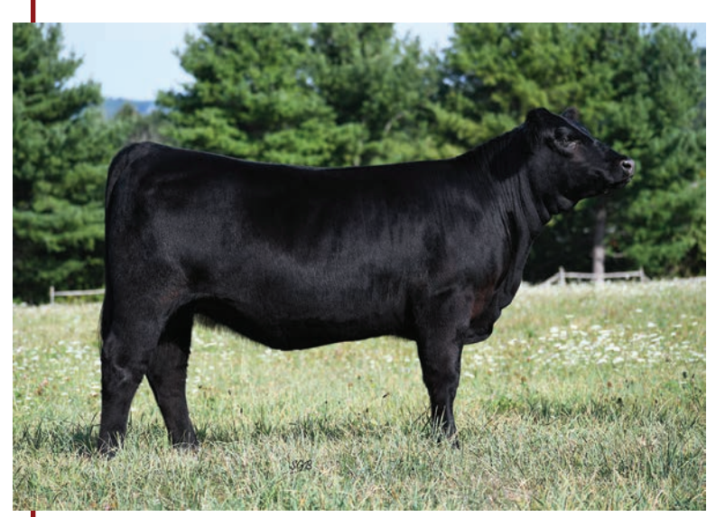
HFSC GYPSY ROSE HG25 ET

Pasture exposed 7/30 - 9/30 to W/C Turnpike 4008G (#3644887). Crystal is a PB Simmental out of a Steel Force cow from Lazy H. She is one of our top producing cows.