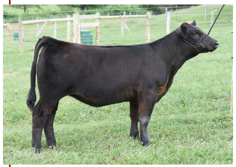
SS-F BALAMORE 2009