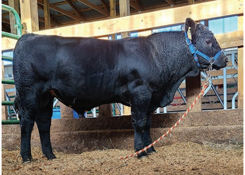
HYLAND NATURAL STAR

3/4 blood simmental bull with white star marking. Halter broke, well muscled, easy disposition. Carries the red gene.