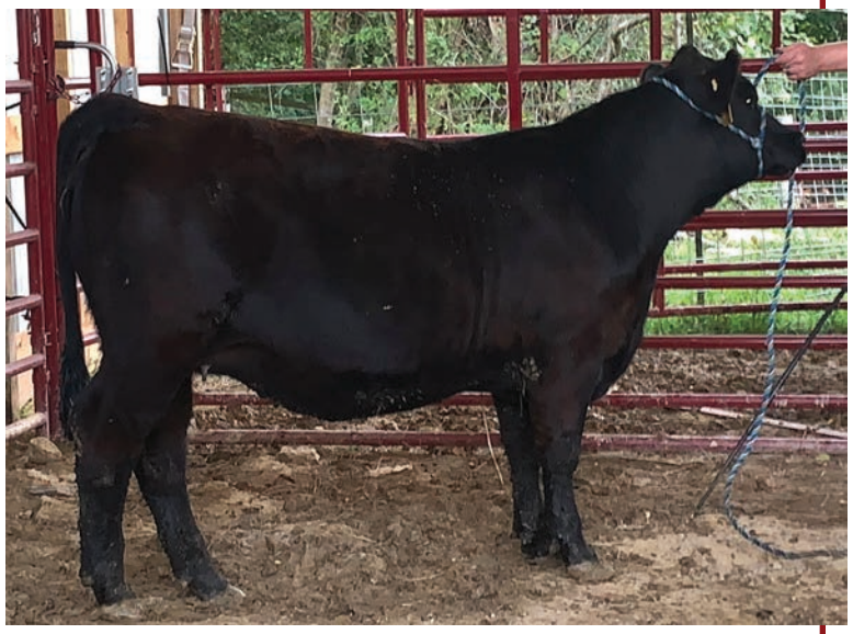
SVJ DEPLORABULL'S DARLING

Here is a purebred that I had to think twice about letting go. Her sire is OBCC CMFM Deplorabull D148. He has certainly made his mark on the Simmental breed. He won calf champion at NAILE and American Royal. The dam side goes back to SVJ Stylish One. She was arguably the best heifer out of S&S Sahara. Those both had great show careers also.