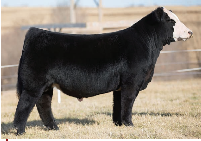
JASS ON THE MARK 69D

Correct in her feet and legs, clean necked, Sells broke to tie, didnt picture well but dont miss her on sale day this heifer gets better and better each