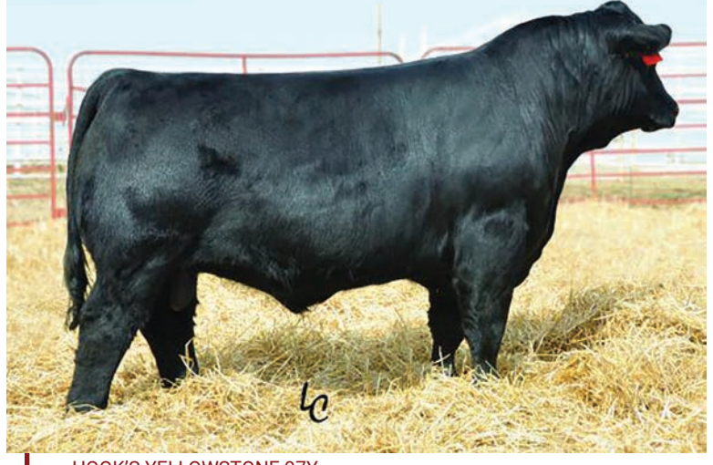
HOOK'S YELLOWSTONE 97Y

Due 3/7/2021 to Shoemaker's Mr E59 (#3327270). Pasture exposed 4/1/20-9/6/20 to Shoemaker's Mr E59 (#3327270). Fiona is a solid black hooks Yellowstone heifer that I purchased at the Stars and Stripes sale. She is very calm and easy to handle. She did a great job raising her heifer this year. The temperament is super docile and maternal instincts are superb