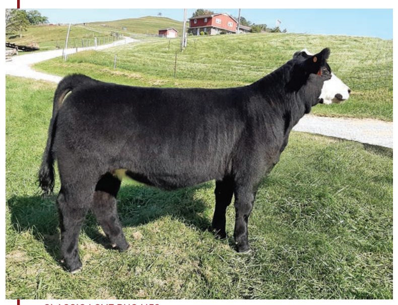
CLASSIC LOVE BUG H52

Executive Order daughters are making an impact in the breed in the show ring and the field. Destiny is no exception. She is complete, sound, and ready to show.