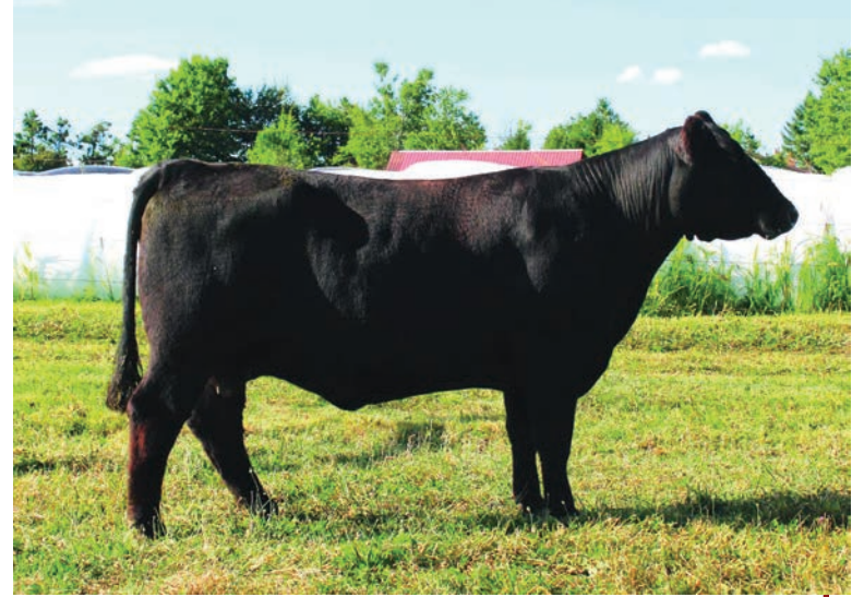
HPF ALLEY 316E

Al bred 6/15/20 to SVF Steel Force S701 (#2340262). Pasture exposed 6/17/2020 - 8/1/2020 to FSCI Top Load D066. You could write a book when talking about the progeny of Alley 247Y, the top seller of the Hudson Pines Farm Dispersal. This Primo daughter is a full sister to recent past high sellers for $43k, $26k, and $20k. Here is a chance to own genetics of one of the most proven and predictable females in the business.