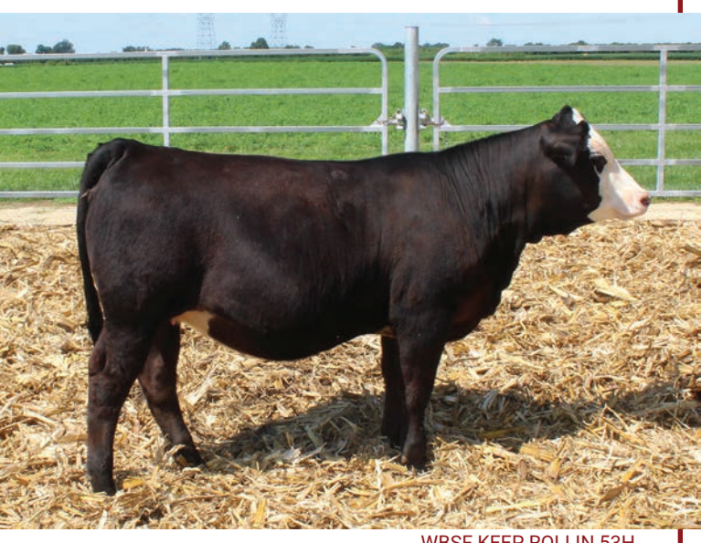
WBSF KEEP ROLLIN 53H

53H has been a standout since birth. She is an attractive baldy female that is sleeked necked And up headed. She is a long, bold sprung female with added dimension. She'll look good on the bark next year. This cow Family always produces And her sire Fully loaded has been making some good ones.