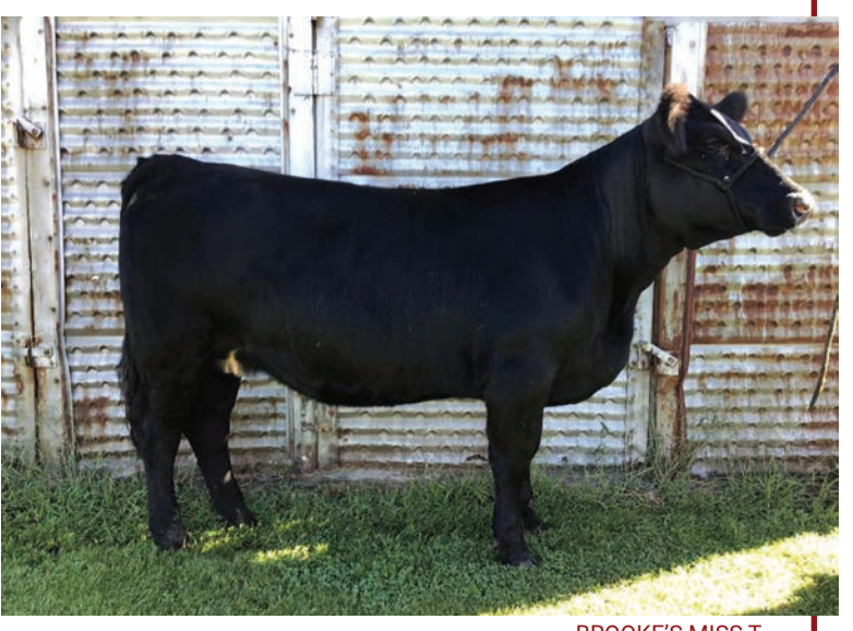
BROOKE'S MISS T

Due 1/29/2021 to CCR Vision (#2152782). Pasture exposed 5-1 /5/31 to Brookes Buddy (#3451731). This 3/4 Sim Hairy heifer is the easy keeping type, there's no doubt she will able to raise a calf just like her Dam has time after time. The CCR Vision calf she is carrying should be a great mating with an API of 122. Dont let this one get past you without taking a look.