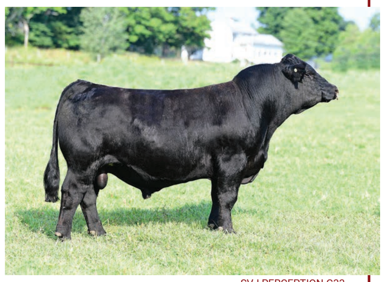
SVJ PERCEPTION G33

If you are looking for a bull that will do nothing but improve your herd Perception is the one. We showed this bull last year but we want to offer our best. He is stout made good legged and sound, he is sure to do nothing but put quality calves on the ground. Bid with confidence on this guy.