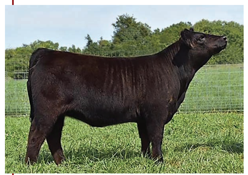
NKCC SUGARHIGH 001H

This easy doing red heifer weaned off as the heaviest heifer we had this year. Her mother is out of one of our foundation Leachman cows from Montana. Her depth and dimension along with her broody look has the makings to be a great cow and show heifer.