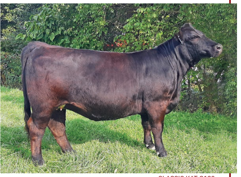
CLASSIC KAT G128

Due 2/15/20 to CCR Wide Range (#2725666). This Uno Mas heifer has gotten better and better with age. Classic Kat has no holes. And to top it off we've bred her to CCR Wide Range. This gentle heifer will be an asset to any herd.