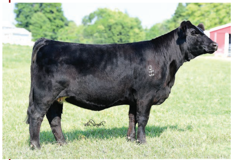
WPCC GEMSTONE G056

Due 3/5/2021 to Executive 187D (#3182363). Sired by the popular Shell Shocked this bred heifer has all the right pieces to make an impact in anyone's herd. She is a very attractive female, who is sound and clean fronted. She is safe in calf, due 03/05/21 to Executive 187D. No Bull exposure.