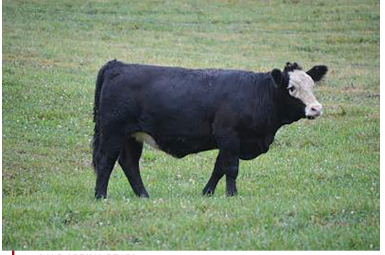
COLD SPRING PEARL

This full face baldy heifer, out of a first calf heifer, is full of future potential! She has a femine front ,with lots of body and depth through her middle, to go along with sound feet and leg structure. This heifer is extremely docile and quiet and we think she will be a good addition to any breeding program.