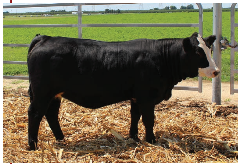
KBS ESSO 57H

Puppy dog personality, kid broke, and a phenotype to stand out in the ring to boot. This calf is out of a half blood first calf heifer that had an exceptional udder and knocked it out of the park her first time out the gate. The So Sweet family needs no introduction in the Simmental world, her grandam is a full sib to the 2018 NWSS Champion Simmental Female and had success in her own show career on the east coast - highlights being New York State and New Jersey State Fair Supreme Female . High Regard females have been incredibly sought after in the industry and we feel strongly that she won't disappoint.