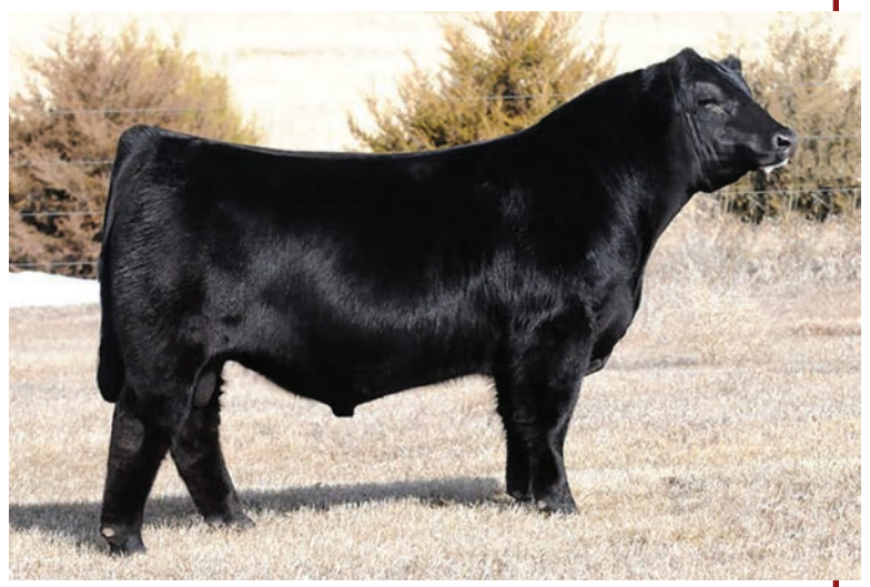
W/C RELENTLESS 32C

Here is a black baldy heifer calf that will turn your head on sale day. She is great structured and sound moving with an exceptional disposition. She will make a great addition to any beef herd or show ring. After her days in the show ring she will make an exceptional brood cow.