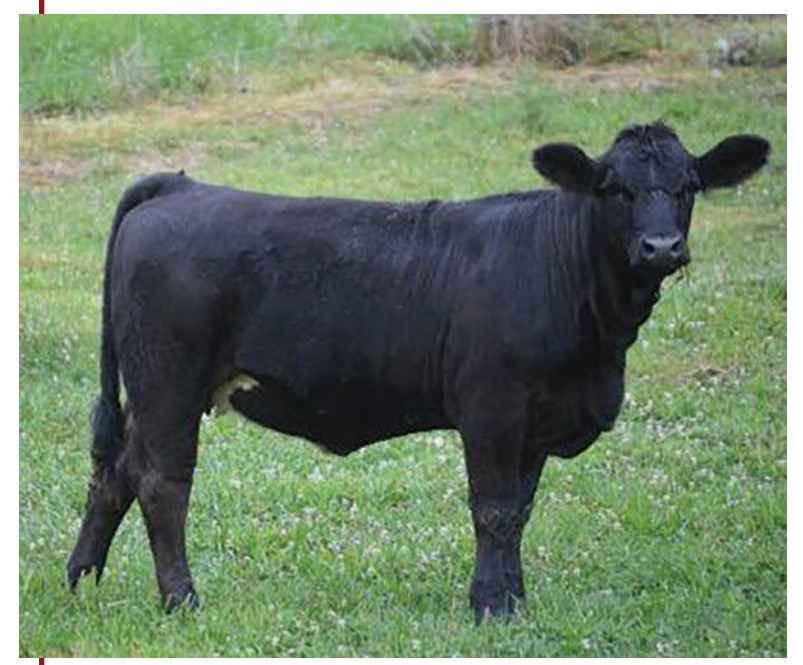
COLD SPRING PAISLEY