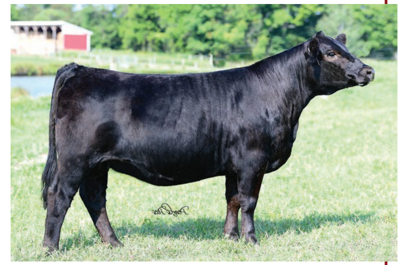
SVJ SHE'S THE ONE G100

Due 2/25/2021 to Deplorabull (#3150188). Pasture exposed to (#). Here is a prime opportunity to grab one that we intended to hold onto. She's the one we showed last year and won her class at keystone, second in Louisville. She was pinned to go to Denver as a big one to sell but with all the uncertainty going on right now here is the chance to own her. This cow family is the base of our program and they just flat work. This one speaks for herself. DUE 2-25-21 to Deplorabull.