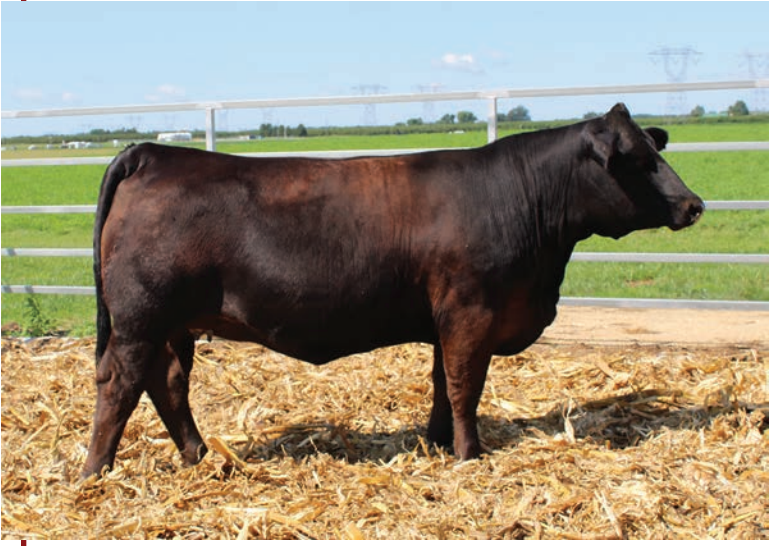
WBSF ENHANCE 74G

Due 12/8/0020 to WC Lock Down (#2658496). Pasture exposed 3-1-20 to 7-21-20 to KBS Storm 98D (#3723276). 74G is a direct daughter from the all Time great Upgrade. She is complete, fault free with added power And dimension. Bred up early to the baldy calving ease specialist WC Lockdown. It looks like She,Äôs going to have a great udder.