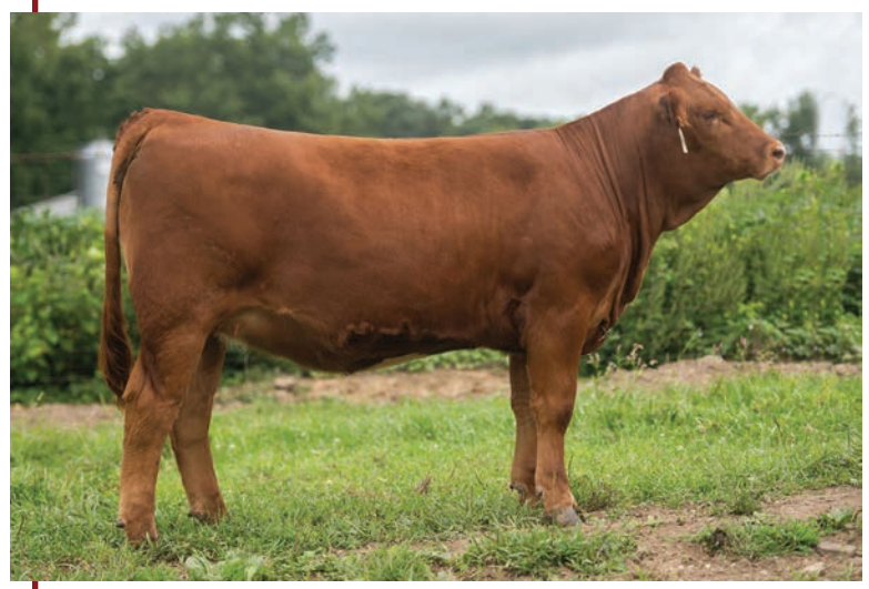
CHARMONT FIESTA G51E