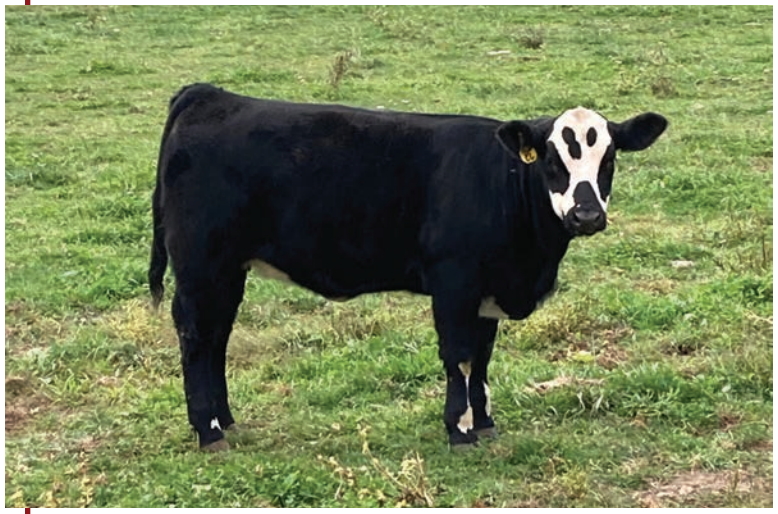
FLOWER GIRL 39H