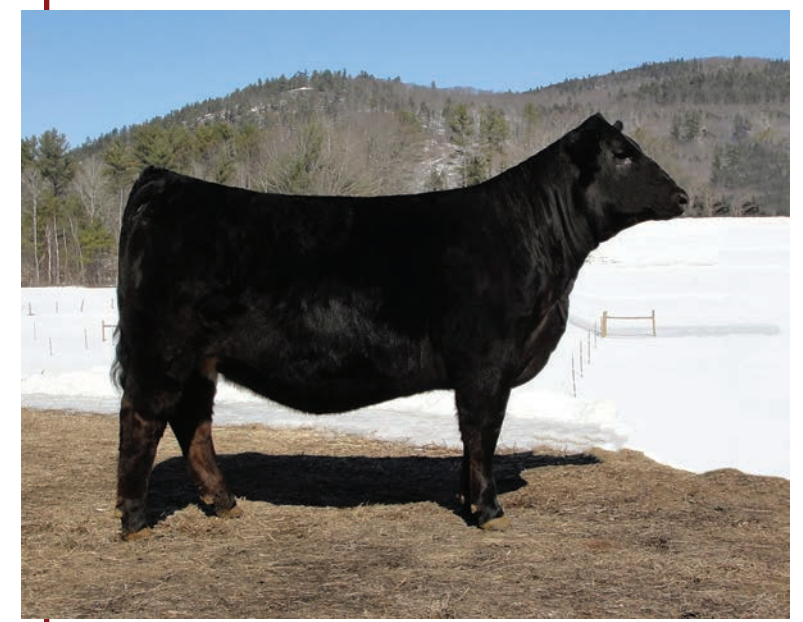
$5,800 MATERNAL SIB TO TRIPLE M P2B H1

This Main Event son has been my favorite bull calf the last few years, And i think you, Äôll agree why. He has the look of a great herdsire. Long, correct And powerful. If You want to make them longer And better fronted he should work. Stems from a very functional Cow family. Great disposition.