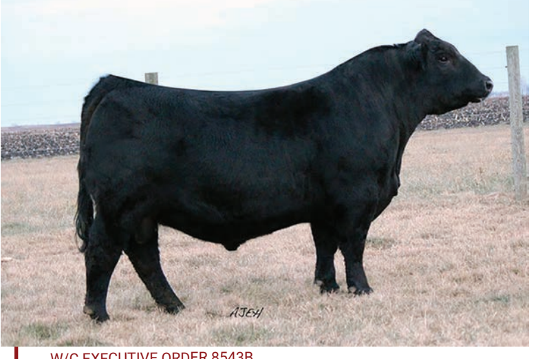
W/C EXECUTIVE ORDER 8543B

ERV Black Satin H001 is a female that has it all pedigree, phenotype and marketability. She is backed by some very dominant Simmentals. Lets just name a few JS Black Satin( Triple Crown Winner), Pays to Believe(Denver Champ), Executive Order and the famous Miss Werning KP 8543U. The "Boots" genetics have been extremely hot in the show industry and we think H001 can do just that show! She is ultra clean fronted, good footed and has great rib shape. Black Satin H001 is not easy to let go of, but we want to continue to offer our best! We think so much of this solid black heifer that we would like to retain 1 flush at our expense and the new owner convenience. Don't miss this genetic gem!