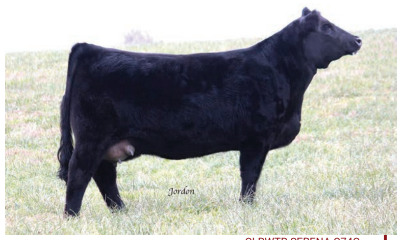
CLRWTR SERENA C74G

BV Mountain Girl G6. ASA#3545882. 3/4 Sim/Ang . Sire: GW Premium Beef Dam: Triple C Famous Girl. She is also an embryo. Her dam was a member of Triple C's Champion Pen of Three in Denver. Due 3/14/2021. Study the genetics backing up this IVF heifer calf pregnancy carefully. Both Sire and Dam are homo black. There are generations of purple banners from both sides of this pedigree. We sold CLRWTR Serena's Executive Order bull calf in the 2019 Pa. Fall Sale for $3,400 at 10 months of age. We couldn't be more excited about the impact Serena has made for us. This W/C Relentless heifer can make a difference for you.