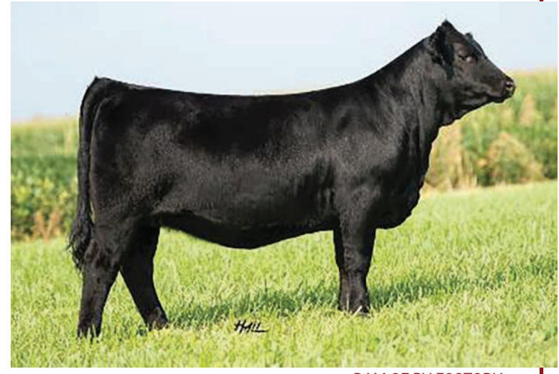
DAM OF BV FOSTORIA

3/4 heifer with lots of length and depth. Fostoria is sired by the popular calving ease bull, CCR Cowboy Cut. She has outstanding EPD's with an API of 135.5. Check her out.