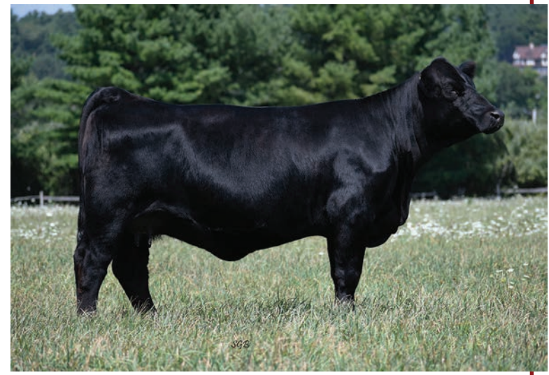
HFSC FIRE AND ICE HF13

Due 4/28/2021 to BESH BULL GD334 (#3681324). Just turning 3, Fire and Ice has a future full of production ahead of her. She is long spined, moderately framed, and sound on her feet and legs. She's bred to our solid red Quantum Leap son, who has abundance of muscle mass, and plenty of depth and dimension. Red calves could be in the future for this mating, with Fire and Ice carrying the red gene. Due to calf the end of April. Hillcrest Farm is BQA certified. BVD tested negative.