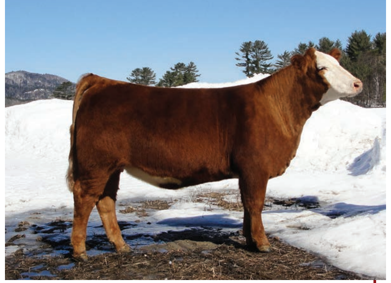
$7,000 MATERNAL SIB TO LOT 33

Here is another tremdous daughter out of my Burn Right Cow who has produced many high sellers! This Classified Daughter excels in terms of growth, weaning weight, and weight per day of age. She weaned heavy and continues to thrive. Extra long spined, big hipped, beautiful head and neck and good at the ground. This solid black heifer is good enough to show and is going to go on and be a top producer of modern day, high quality calves.