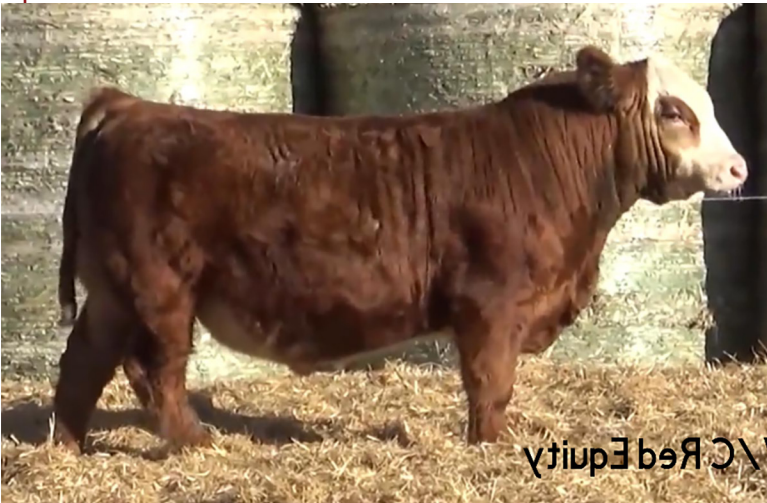
SIRE OF LOT 79

This Red Baldie Bull calf goes back to an awesome Dominance cow that I purchased as an embryo in this sale many years ago. His Dam has had many high sellers to her credit in P.A. and every one of her calves are highly marketable and at the very top year after year! These Payroll calves are plain freaking good and "Payright" falls right in. He is ultra attractive, sound as you can get, has a beautiful rib structure, is nice footed and has so much look to him you just know his heifer calves will be super feminine and current in their look and lines. Higher quality red bulls are few and far between and here is your chance to get in on the goods! I truly believe the Payroll calves are about ready to hit it big! Plan on keeping this dudes calves!