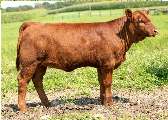
LOT 72 AND 72A

If you are looking for a top quality female for your donor pen, be sure to check out Eden's Walk Stylish. As a two year old, she possesses a huge amount of power and presence, while still maintaining femininity. This young cow is very sound, has impressive rib shape, a smooth shoulder, and to top it off, a perfect udder! Just as impressive as her phenotype, is her pedigree, sired by Bankroll out of the famous Too Cool donor. Stylish is a maternal sister to breed leaders SSC Shell Shocked 44B and SSC Victorias Secret 49B, and since Tool Cool is 14 years old, this could be one of your last chances to add a red Tool Cool female to your herd. Equally impressive as this young cow, is her powerful red heifer calf sired by Lover Boy. Look at the cow power she has backing her, Too Cool on the maternal side, and Right To Love on the paternal side.