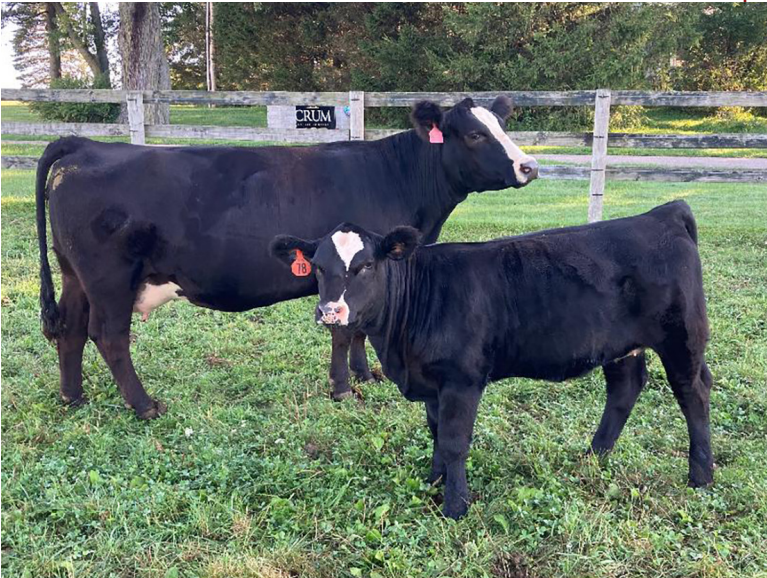
LOT 76 AND 76A

Due 4/25/2024 to TJSC HAMMER TIME 35D (3185062). Miss High Profile G97 has been a top producer on our farm. She is an excellent brood cow that is very clean up front, extra depth, and very clean in her makeup. She was one of the top selling open heifers in Eastern Spring Simmental Sales in Columbus in 2020. She sells with a clean "Something About Mary" heifer at her side born 3/13/2023 and rebred to the exciting TJSC Hammer Time bull to calf in April (safe in calf). Both the cow and heifer calf have a splash of white on the forehead.