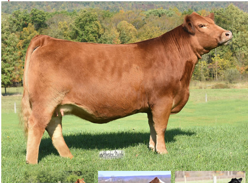
TOP: LOLA; BOTTOM: MATERNAL SIBS TO LOT 1 A-C