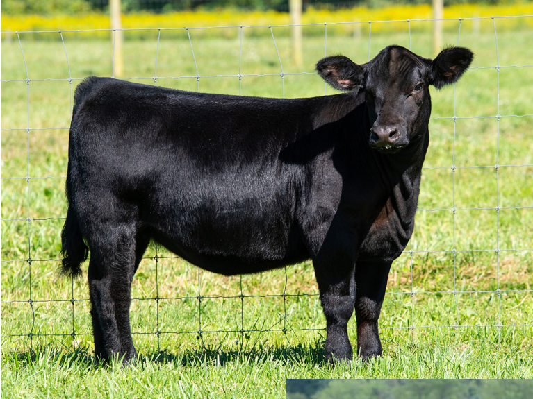
LOT 12, DAM OF LOT 12

Unique breeding piece here with big-time showing potential. Lady Rosemary is a dual-registered female (5/8 Simmental, 1/4 Maine) that would allow you to show her at both the Simmental and Mainetainer Jr. Nationals. This female combines power and ruggedness with that added cool-look and extension up front, added foot size, and ring presence. Her donor dam, JSC Kitty, is a foundation female for our program that has proven to be as versatile as any female in production for us. Kitty was our selection from Jones Show Cattle many years ago that has consistently put females in the show ring as well as created herdsires for our program (Currently a Databank son, and previously a Broker son). We think this young female has intriguing potential to be utilized in many different breeding options; whether that is in the Simmental, Maine, or Club-calf industries. Her sire, SAM, is easily the most talked about and sought after genetics in the Simmental breed, and his influence has shined through on this female. Trust in the consistency and get in on this pedigree - Bid with confidence.