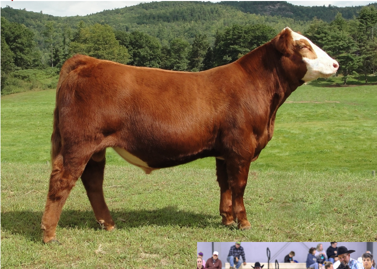
LOT 78 AND MATERNAL SIB TO LOT 78

DOB 9/12/2023 ASA 4247186 SIRE THSF LOVER BOY Amelia F64H is one we should be keeping but we are committed to offering our best. This red W/C Fully Loaded 90D daughter is as deep bodied as they come. She is long necked with a huge hip and did we say she is deep bodied and thick made? This young cow will be easy to find. She has a very nice red bull calf at side. Be sure to look her up!