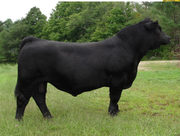
LOT 85 DAUGHTER AND SON

Bull consigned by Mankey Meadow's Farm PB SM ASA 4241244 DOB 3/25/2023 Tattoo L1 WLE COPACETIC E02 BMR EXPLORER ROCKING P PRIVATE STOCK H010 SVJ PRINCESS X151 RP/MP BUILT TO LOVE A021 SVJ STYLISH ONE