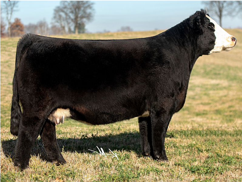
DONOR DAM OF LOT 39A AND 39B

Embryos are full sibs to "Girl Next Door." Our Gigi donor is a direct daughter of the most decorated female in the Simmental breed, HF Serena, who has amassed over 3 million dollars in production over her lifetime with numerous show titles to her record and her progeny. In 2022 alone, Serena produced -STCC Tecumseh (half-interest sold for $620,000 to Freking Cattle),a Berwick daughter who was Champion Simmental at the 2022 NAILE, the 2022 ASA percentage Show Heifer of the Year, and many other state fair and national show winners. Gigi, who is arguably her best baldy daughter, was a sale highlight and top seller at Trennepohl Farms. She possesses that added muscle shape and foot size while still being good-looking with an excellent running gear. These added features are evident in the high end females popping up all over the country with several over $10K, including a $13K Blacklist daughter and a $11k Copacetic daughter. We have 11 Gigi daughters for this fall sale season and they will easily find their way to the top of the sale results. We think the potential for this donor is endless and this mating to Relentless is already a proven success. Big time show heifer appeal, and even bigger donor potential. Guarantee one pregnancy if implanted by a certified embryologist.