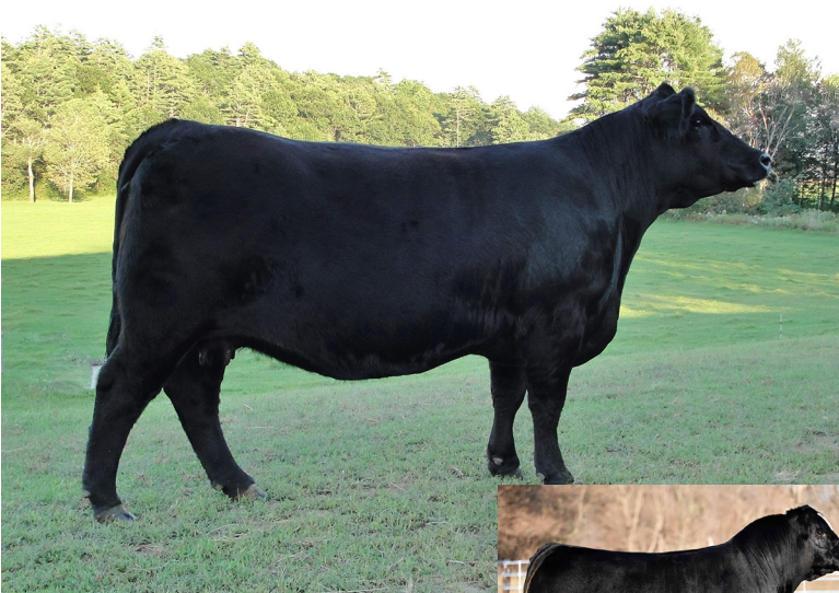
LOT 58 AND SIRE OF LOT 58