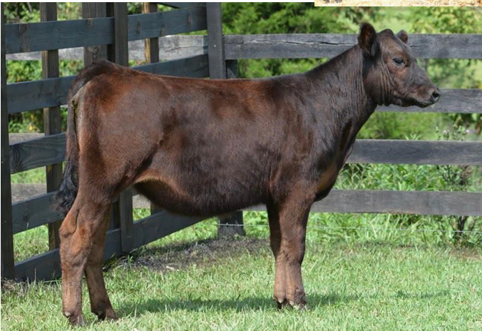
LOT 7A, EXECUTIVE ORDER, LOT 7B