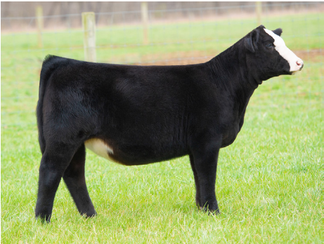
LOT 39 MATERNAL SISTERS