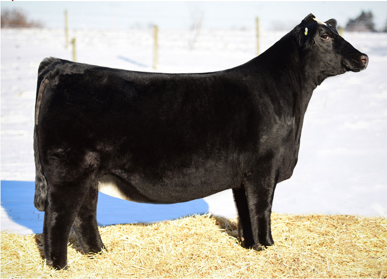
DAM OF LOT 27

Open heifer consigned by Pine Creek Show Cattle PB SM ASA 4244836 DOB 2/4/2023 Tattoo T09L W/C LOADED UP 1119Y TRIPLE M RELENTLESS 02F JASS ON THE MARK 69D GRTF DIXIE 3J JASS SABLE’S TIME 53X GRTF TRACY’S DIXIE BT01