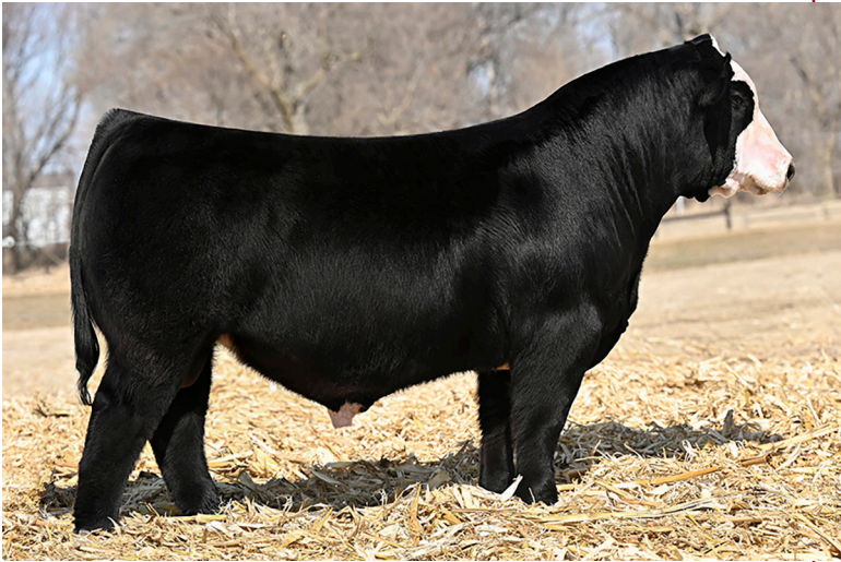
SIRE OF LOT 13

Here's a solid black powerhouse April Female sired by the Bank On It bull and out of a really nice Relentless 3 year old. Study her pedigree back on the Dams side to the Zeis Miss Drive N423 cow, an instrumental female that help propel modern Simmental females! "Lookin Bank" is ready to show all year and will make a top cow in any herd. She's modern in her look, great bone and foot, loads of performance and mid section, is super haired, and has that extra look. She wont be hard to find on sale day!