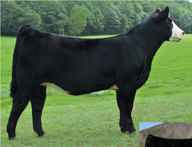
DAM OF LOT 24 AND LOT 24