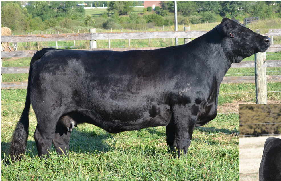
LOT 3 DAM, LOT 3 SIRE

Recip is a commercial cow. This sexed heifer pregnancy to Natalie and Pandemic should peak every red Simmental lovers interest. This same mating commanded $7000 in H2OS dispersal sale this past fall. Due 3/4/24.