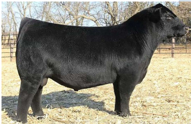
SAM, REMEDY, SHEZ TO COOL