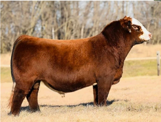
LOT 2 SIRE, LOT 2 DAM